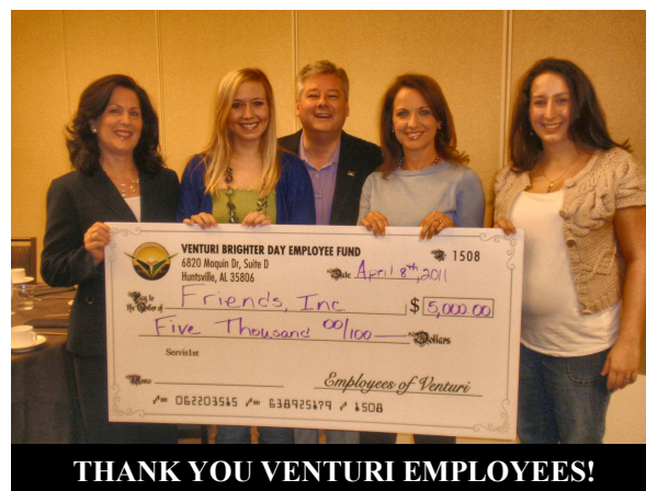
THANK YOU VENTURI EMPLOYEES!