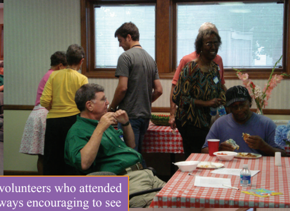
Thank you to all the volunteers who attended the luncheon. It is always encouraging to see your smiling faces and hearing all about the many things you are doing.